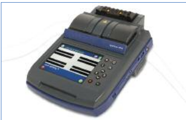
OptiSplice M90e Fusion Splicer | Photo STE003