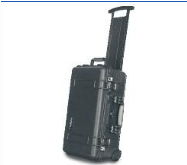
M90e Fusion Splicer Carry-On Case | Photo NS81

Advanced statistical data analysis features allow for the operator to graphically view the performance of things such as the cleave quality over a period of time. This enables the operator to make informed maintenance decisions based on data analysis, such as when to replace a cleaver blade.