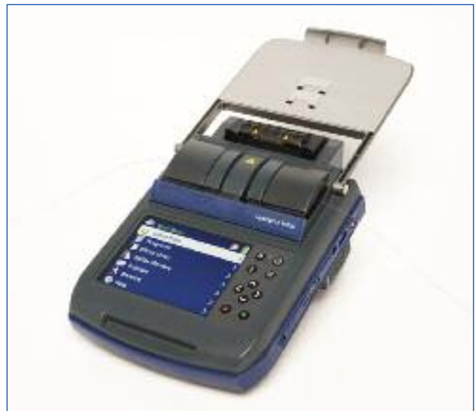
OptiSplice M90e Fusion Splicer | Photo STE004